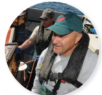
Figure 2 - Fisherman wearing PFD