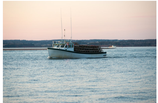
Figure 1 - Fishing vessel off coast of PEI

Not taking the proper precautions to prevent falling into the water can result in drowning.